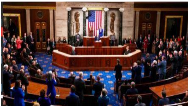
US House of Representatives where the State of the Union address is given