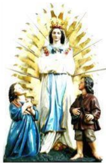
Mary & the shepherd children

And one way he verifies that a certain prophecy is legitimate is that it follows the rules of apocalyptic prophecy. And I used to think that the only apocalyptic prophecy was found in scripture, for example the last six chapters of Daniel, for example chapters 6 through 20 of Revelation. The rest of Revelation is not apocalyptic literature, it's End Times prophecy but it does not follow the rules of apocalyptic prophecy.