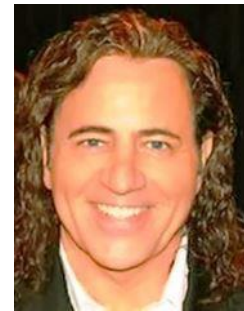
Pastor Kim Clement

And I did discover, let's say about six years ago that the prophecy that Mary gave at La Salette, France was apocalyptic literature, and just a couple years ago I discovered that the Protestant prophet Kim Clement received apocalyptic prophecy on March 25 th , 2011 which was the Feast of the Annunciation, and in his prophecy he said that a woman will save America,