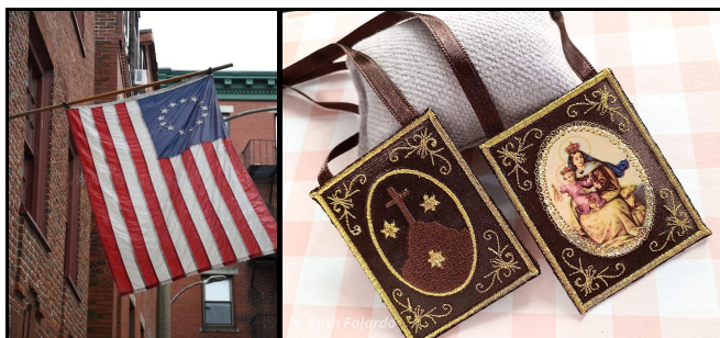
Our defensive weapon:

The angel's sword stands for the Rosary.