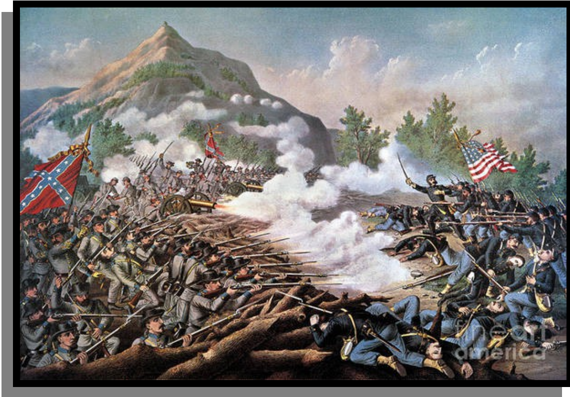
The Battle of Kennesaw Mountain in Georgia, 1864