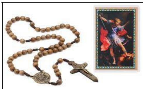
Our offensive weapon:

At the end of the preceding 3rd Peril, that last, long blast of the trumpet was heralding Heaven's imminent intervention, just described. When Americans are almost at the point of being overcome by the violent evil invading their land, the Illumination of Consciences will take place: Simultaneously, everyone on earth will come to know the true spiritual state of their souls—as GOD sees them . Based upon Washington's vision, nuclear war will not precede the Warning (also called the mini-Judgment). That supernatural event is meant to spare as many souls as possible from perdition. Heaven will give everyone a chance to repent, including those who would have been eternally lost had nuclear war happened first. Legions of white spirits (angels and saints —otherwise Washington would have simply said 'angels') descend with the bright angel, who bears the American standard and a sword , to aid Americans in the combat against evil. The word written on his crown reminds Americans of the need for unity (especially the unity of faith/religion). Responding to this sign, Protestants could convert and join Mary's Remnant—referred to in the phrase 'they closed up ranks'. The Remnant gathers into refuges—aided by the 'legions of white spirits'. In the refuges, Americans renew the battle, using Mary's weapons carried by the bright angel: his sword symbolizes Mary's Rosary , and the cloth flag symbolizes her brown Scapular .