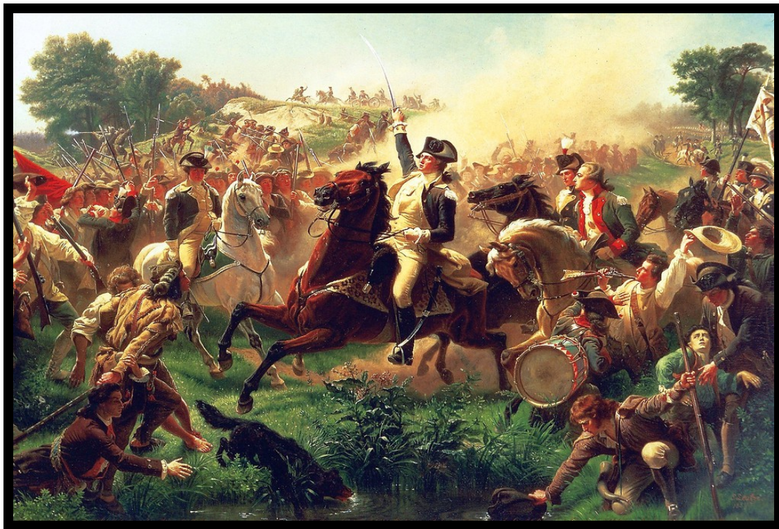
The Battle of Monmouth in New Jersey, 1778

The heavenly visitor's arm extended eastward: east indicates that GOD is directing the communiqué. Washington sees the major continents of the world, and lists them in the order we typically pronounce the four compass points: Europe ( North ), Asia ( East ), Africa ( South ), and America ( West ). Washington also identifies the two oceans that bookend America. A dark shadowy angel floats over the Atlantic between Europe and America; he scoops and sprinkles ocean water upon America with his right hand, indicating GOD's favor. The angel then scoops and sprinkles ocean water upon Europe with his left hand, indicating less favor . Immediately, from each of those countries a cloud arose and merged mid-ocean, where it stayed stationary for a while. This shows the initial cooperation between the American colonies and Britain—a virtual meeting in the middle. But then the cloud drifted westward and enveloped America in murky folds that represent Britain's tyranny over America. Periodic flashes of lightning, and the smothered groans and cries of the American people, symbolize America growing increasingly distressed under British rule and the resulting Revolutionary War (the War of Independence) , in which Washington was presently engaged.