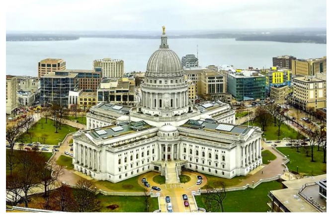
The Wisconsin State Capitol