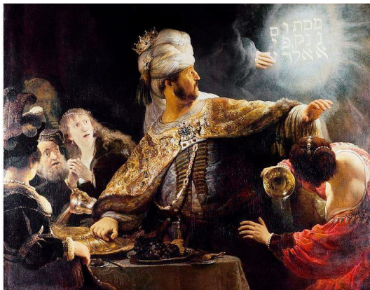
Belshazzar's Feast by Rembrandt