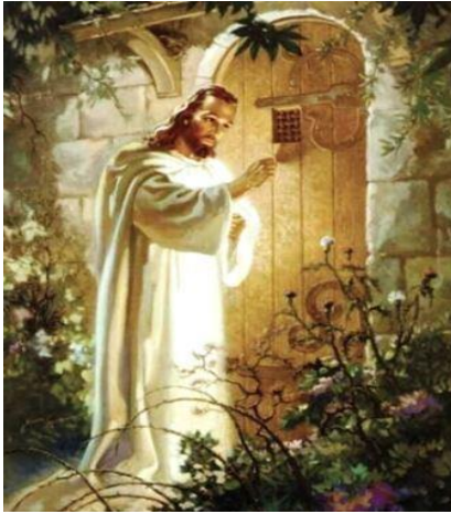
Jesus knocks at the door

So who is this hand? Who is the person connected to this hand? Well we know in the Bible that Jesus knocks at the door. He says, "I stand at the door and knock."