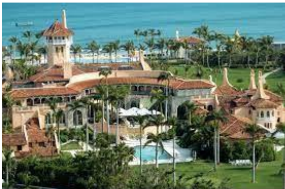
Donald Trump's estate in Florida, Mar-A-Lago

As I say symbolism is what we're talking about here, so being bruised in the ears, I think that means that he can't hear his supporters or he can't communicate with them. I think that's what it means. In other words he's in isolation, and of course I think he is in isolation.