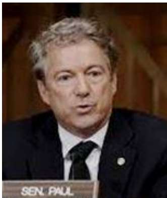
Senator Rand Paul

So symbolically that symbolically this is exactly what is happening right now. You could say that this is not really a prophecy, but I think since it is a prophecy, what the Holy Spirit is telling us is that this is going to continue, and it's going to get worse. In other words the senators and congressmen, that's one more group that is not going to save America. And why? because there's too much antagonism, too much division, Congress is bitterly divided, and as such it can't save America.