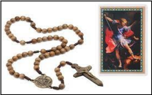
Our offensive weapon: The angel's sword stands for the Rosary.

with the bright angel, who bears the American standard and a sword , to aid Americans in the fight against evil. The word written on his crown reminds Americans of the need for unity (especially the unity of faith/religion). Responding to this sign, Protestants may convert and join Mary's remnant. Americans en masse now regain courage. That 'they closed up ranks' means they gather into refuges—guided by the white spirits (angels and saints). In the refuges, Americans renew the battle, using Mary's weapons carried by the bright angel: his sword symbolizes the Rosary , and the cloth flag symbolizes the scapular . 'The fearful noise of the conflict' evokes the terrifying reign of the AC beyond the refuges. For the eighth and final time (8 symbolizes new beginnings), the beautiful visitor addresses Washington as “Son of the Republic” and once more says, “look and learn.” Also for the final time, the shadowy angel sprinkles