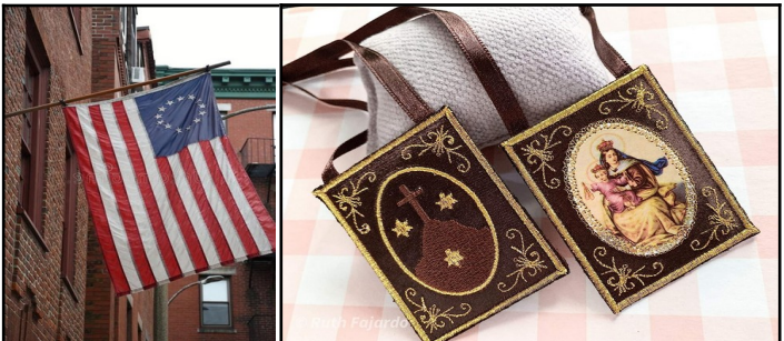
Our defensive weapon: The American flag, or standard, stands for the Scapular.