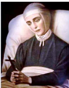
Anne Catherine Emmerich

And this is a vision that Anne Catherine Emmerich had. There are quite a few people who are quoting this, and I think I'll read this vision. It only takes a couple of minutes and Anne Catherine Emmerich had a vision of a pope in these End Times and it sure does sound like Pope Benedict. Here's what she saw in her vision of August 10, 1820.