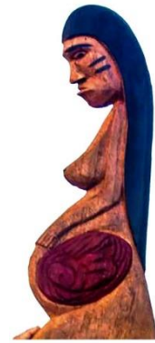
Pachamama Pagan Idol

As you can see it's pure ugliness, but they were worshipping this. There's quite a few videos showing that, and that's what, as you can see, was right in front of the Pope as he announced the results of this Amazon Synod and he stank the tank. He selected all of those bishops who were favourable to him.