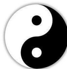
Yin-Yang Pagan Symbol