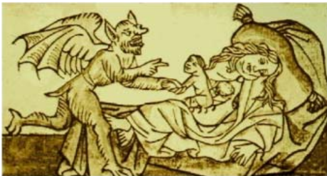
Antichrist will be born of a Hebrew nun

We are ready for the sixth section of the La Salette prophecy and Mary does not give a date for this section either but rather she names an event that will have a definite date, in other words, the birth of the Antichrist, although we don't know at this time what that date was. So let's move on to this sixth section of La Salette which I call the birth of the Antichrist. Remember, these titles are not in the La Salette prophecy; I have added these titles to distinguish the seven different sections. The date I give here, 1954, is just a guess. I took that as Recep Erdogan's birth date but I am NOT saying he's the Antichrist because, as I say, we have clues but we won't know who the Antichrist is until he takes office.