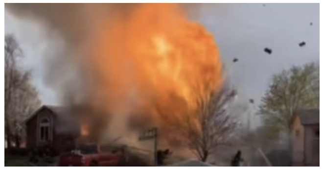
HUGE SECOND EXPLOSION, WITH FLYING DEBRIS

Paula: Someone on Facebook named Lori Moats uploaded to KAKE News an eyewitness video of the garage fire in progress. At the beginning of that video, papers are seen flying around (on the left side of the screen), like Dana described in his dream. While firefighters are busy coordinating their plan of attack (after being dispatched to the scene, following the first explosion that resulted in the blaze), a second explosion occurs and it is HUGE!