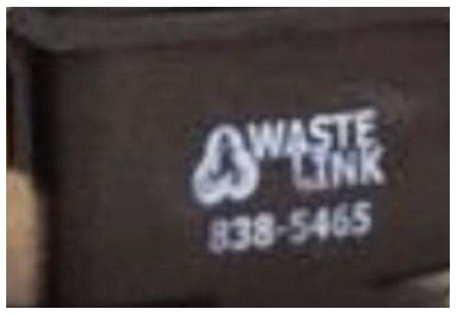
PHONE NUMBER ON TRASH CANS AT THE CURB

Also interesting are these obscure details: The phone number on the two trash cans does not include an Area Code, but the website indicates it's 316; and if you're out of the locality, you would start by dialing a 1. In that case, the phone number of the Waste Link company is 1-316-838-5465 , which totals <u>50</u> (the Rosary).