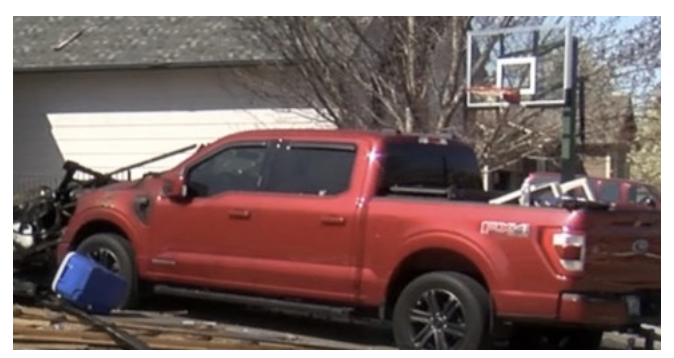
TRUCK; BASKETBALL HOOP IN BACKGROUND

WT: Here is a slide taken AFTER the fire, showing the damaged pickup truck and the basketball hoop in the background: