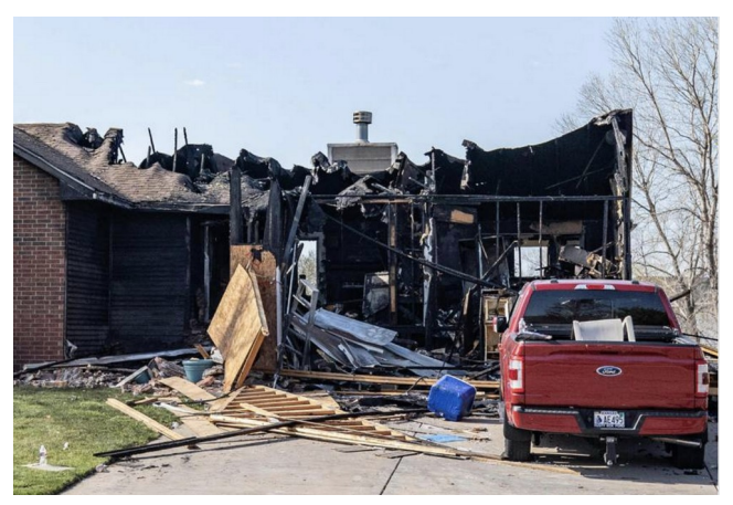
THE AFTERMATH (note the house's brick facade)