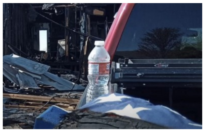
FOLDED FLAG SET UPON THE TRUCK TAILGATE

WT: This next slide shows some of the clean-up after the fire: