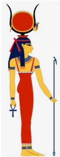
Hathor the cow goddess

This is Hathor the cow goddess. This is in the statue form, and you see the circle in the middle, the worship of the Sun; you see the worship on