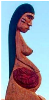
Pachamama, mother earth goddess.

And so that is what the ankh cross is. It uses the two ideas that Satan uses the most when he wants to come up with a symbol, to supplant the cross and they are derived from the most powerful forces in nature, one is the Sun; all pagan cultures come up with Sun worship and they all come up with fertility worship.