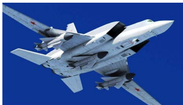
Russian Tu-22M3 bomber

It's a horrible thing because three of the four crew members on the plane died and here is a picture of the plane; it's a Russian plane and it's a fairly old model but it is capable of carrying nuclear bombs, although they said it was not armed at the time.