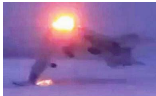
then split in two

It's a horrible thing because three of the four crew members on the plane died and here is a picture of the plane; it's a Russian plane and it's a fairly old model but it is capable of carrying nuclear bombs, although they said it was not armed at the time.