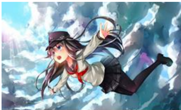
Japanese Anime girl flying

“Since the tree was so high I spotted a highway a few meters away. I was thinking about Japanese Anime and suddenly I thought about jumping and ending it all. (Don't ask why, I don't know, it was just part of my dream). I was about to jump when a bus stops right under the tree causing me to say, ‘God doesn't want me to end my life just yet’.”