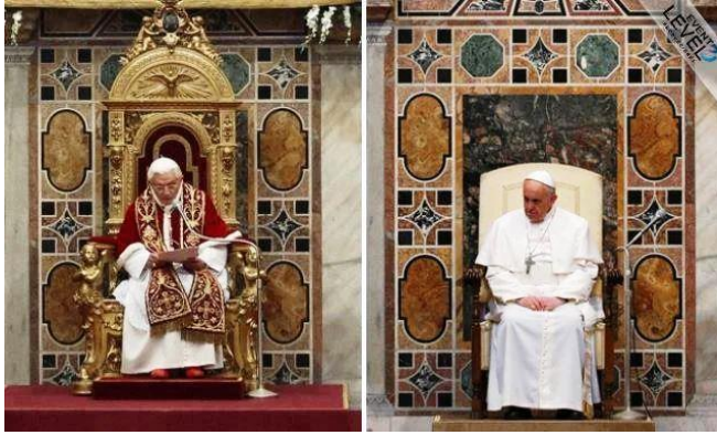
The original St Peter's chair (left), and Pope Francis sits in a replacement chair (right)