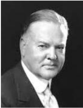
Herbert Hoover 31 st President of the United States

which makes me a little nervous about whether this comes from the Holy Spirit or not. Let's look at the next slide which I have.