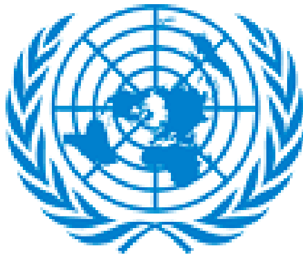
United Nations Logo

Now the grey rain outside suggests gloom and doom. The grandfather clock suddenly moving very fast, indicates that this is indeed a symbolic part of the dream. The grandfather's clock is not actually moving fast. That symbolizes that time is moving fast, moving quickly,